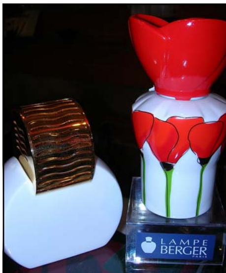
New lamps from Lampe Berge

Given stronger purchasing power, we are back in the market looking at a number of brands and categories that represent much better value today than they did several months ago. Stay tuned.