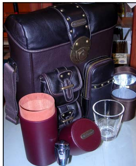
Max Benjamin Mini Cigar Bar