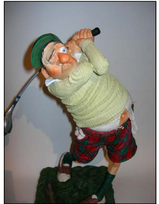
The new Forchino Collection has arrived in store. This is one of several golf themed pieces. The detail in his work is unbeliev-